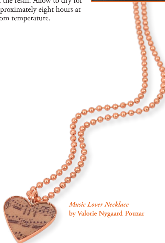
Music Lover Necklace by Valorie Nygaard-Pouzar

Check out our full Education Station online! www.rings-things.com/resources